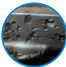
Pitting on the VNT blades