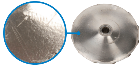
'Orange peel' effect on compressor wheels