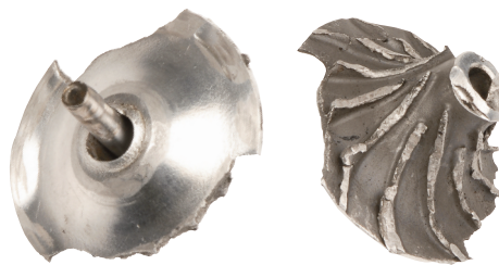
Complete component failure