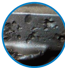
Pitting on the VNT blades